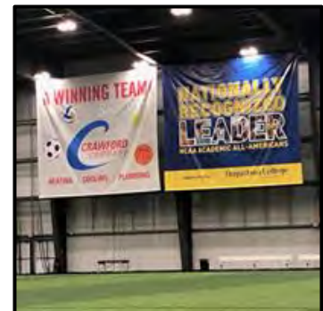
Crawford and QC Storm Pint Glass Giveaway- January 10, 2020